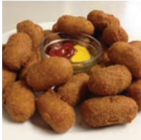
20452 Whole Grain Mini Chicken Corn Dogs .67oz ea 2/5 lb bags 120 cases/pallet