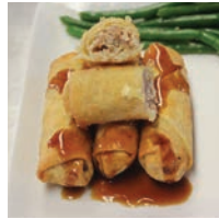
80846 Chicken Egg Roll 2oz ea 160 count bulk 90 cases/pallet