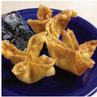
70150 4 Star Crab Rangoon 1 oz ea 4/25 count bags 100 cases/pallet