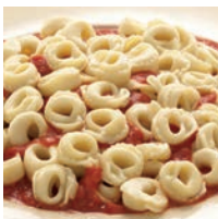
670 Cheese Tortellini 2/5lb bags 150 cases/pallet