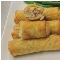
80845 Pork Egg Roll 2oz ea 160 count bulk 90 cases/pallet