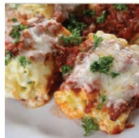
262 Cheese Lasagna Roll-Ups 3.5oz ea (5 trays of 12) 60/3.5oz bags 140 cases/pallet