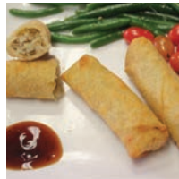
80847 Vegetable Egg Roll 2oz ea 160 count bulk 90 cases/pallet