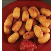
20450 Mini Chicken Corn Dogs .67oz ea 2/5 lb bags 120 cases/pallet