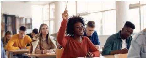
K-12 & HIGHER ED