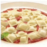
0115 Square Cheese Ravioli 10lb bulk 150 cases/pallet